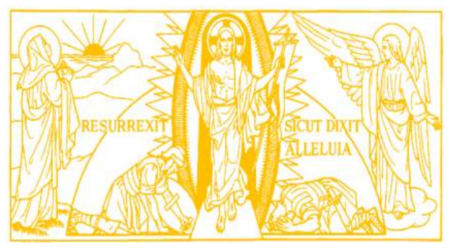
946 Our Lady of Mercy-2

10:30AM The Parishioners of Our Lady of Mercy