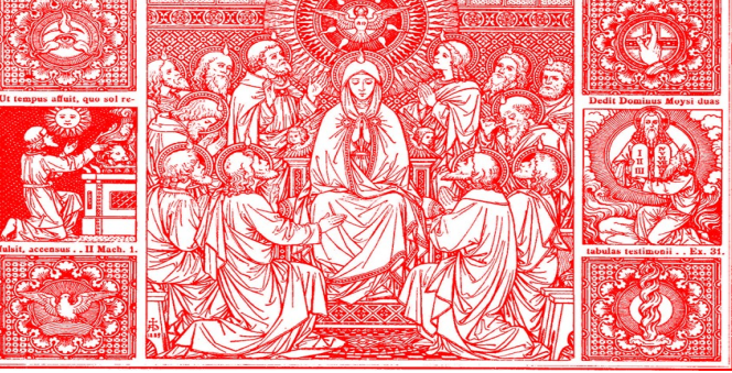
946 Our Lady of Mercy-2