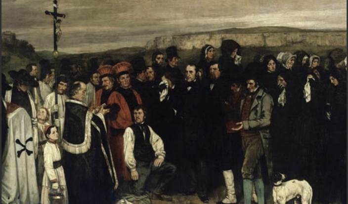
Mass for Deceased Parishioners who died this past year Sunday, November 6, 2022 10:30 am

All the Holy Souls, Pray for Us as We Pray for You