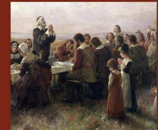
Join us in Giving Thanks to God for Our Blessings & Bounty