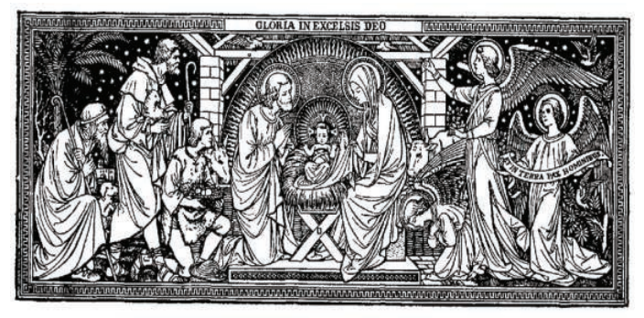
946 Our Lady of Mercy-2