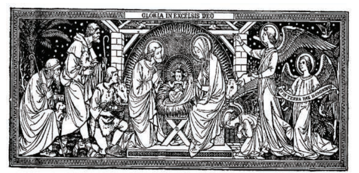
946 Our Lady of Mercy-2