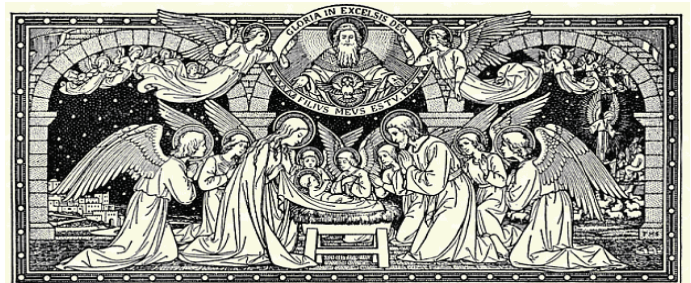
946 Our Lady of Mercy-2