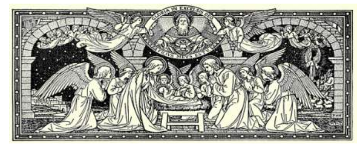
946 Our Lady of Mercy-2

5:00PM The Parishioners of Our Lady of Mercy Parish