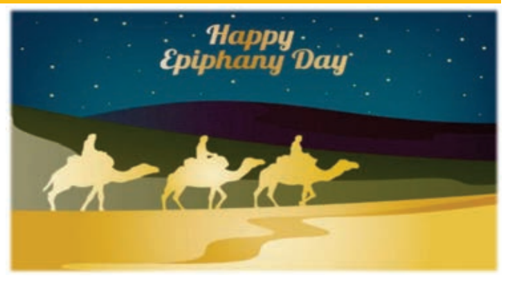
946 Our Lady of Mercy-4

Total Number of OLM Parishioners=2,120 Total Number of Pledges=262 Average Pledge=$4,356