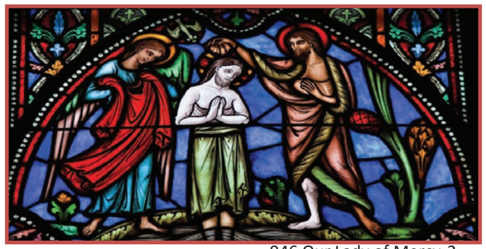
946 Our Lady of Mercy-2