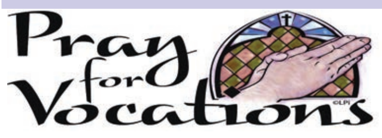
946 Our Lady of Mercy-4

Please pray for the health and well-being of all parishioners during this time.