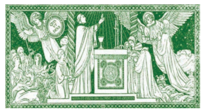
946 Our Lady of Mercy-2