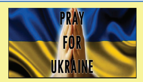
Every Friday at 3:00PM in OLM Church

Join the Legion of Mary at 3:00pm on Fridays to pray the Chaplet, Memorare and Holy Rosary for peace in Ukraine.