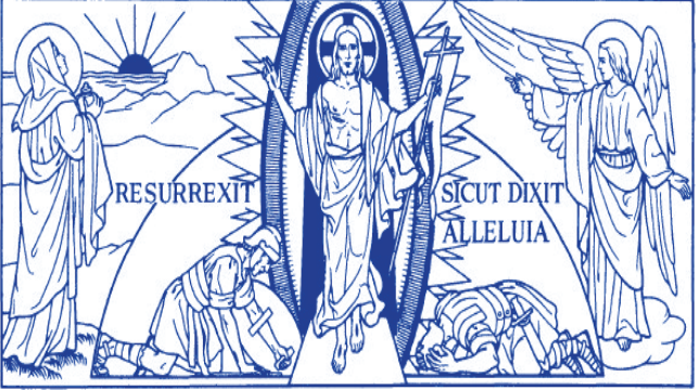
946 Our Lady of Mercy-2