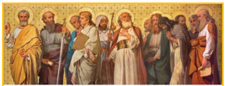
With gratitude to Almighty God the Church in the Diocese of Providence Joyfully announces and requests the honor of your presence at the Presbyteral Ordination of