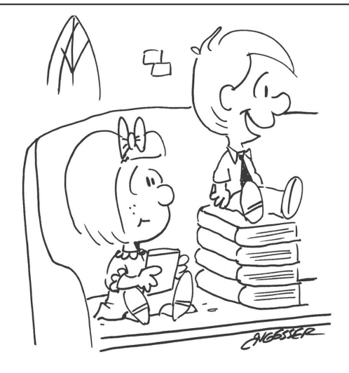
"Dad's really lovin' the pastor's Father's Day sermon on the fifth commandment."