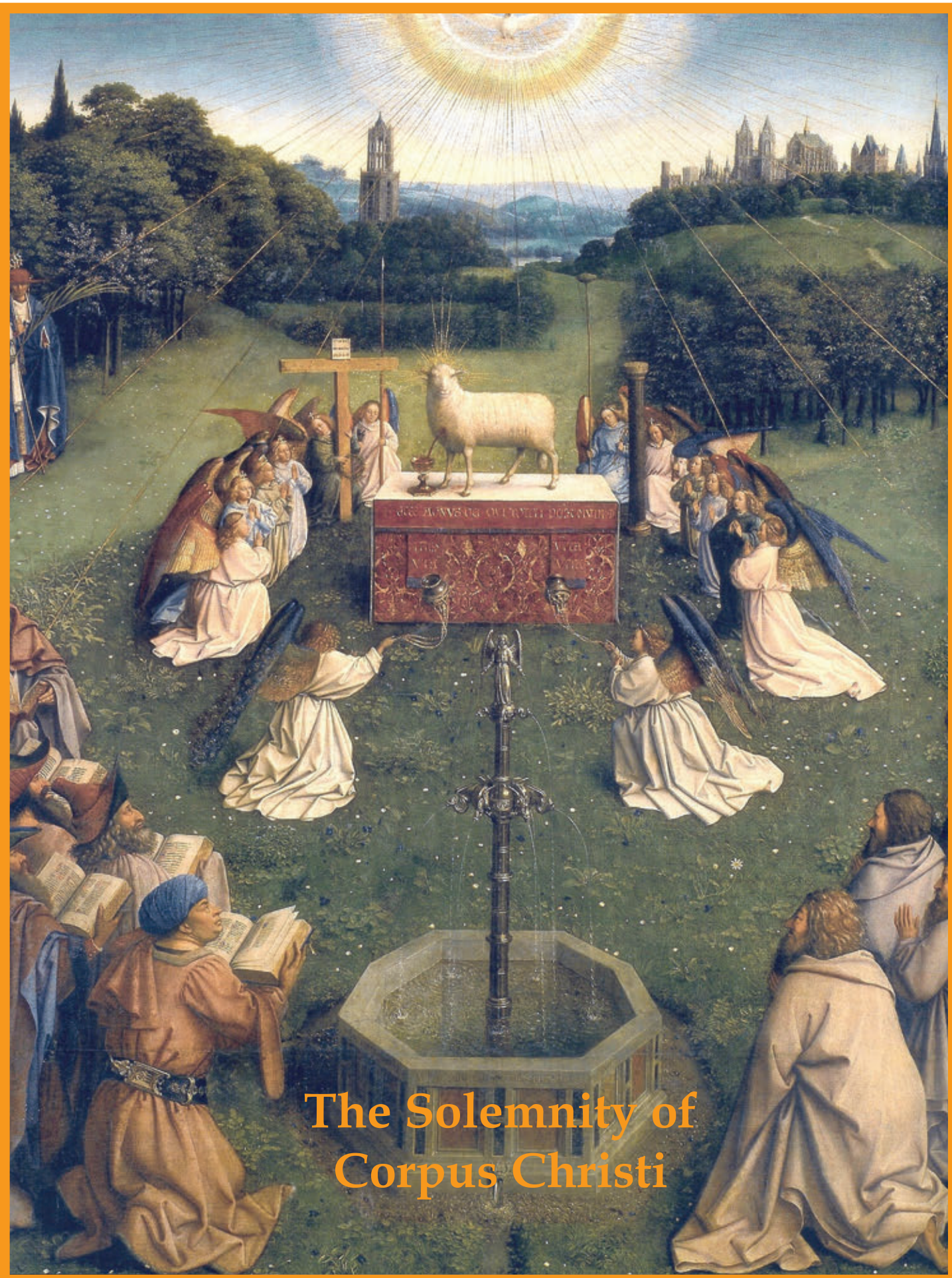
The Solemnity of Corpus Christi