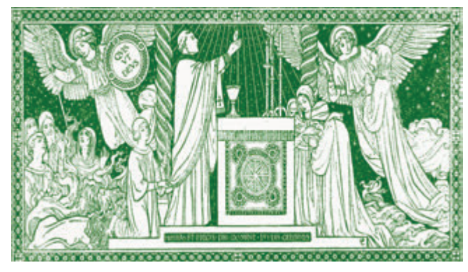
946 Our Lady of Mercy-2