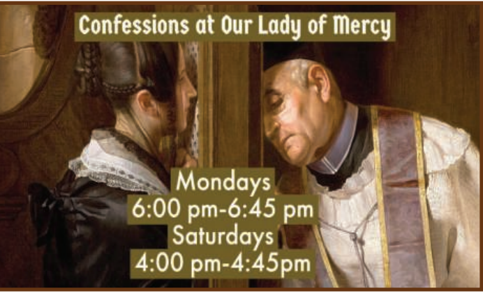
946 Our Lady of Mercy-2