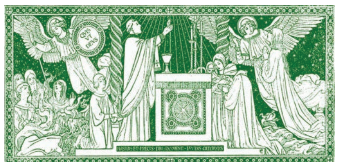
946 Our Lady of Mercy-2