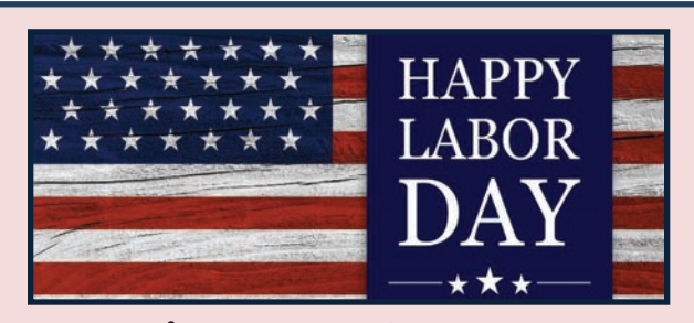
Monday, September 5, 2022 Labor Day Holiday Mass at 8:30am The OLM Parish office is closed

Leave a Legacy of Faith for the next Generation! Remember Our Lady of Mercy Church in your will or estate.